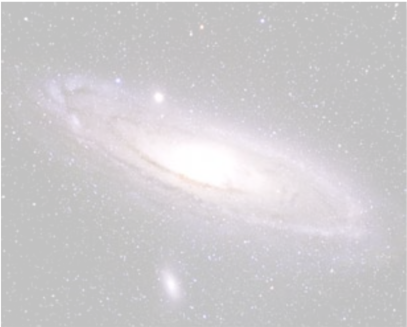
Andromeda Galaxy, At about 2 million light years away, it is the nearest major galaxy to our own Milky Way galaxy. Astronomers think our own galaxy looks ery much like this one.